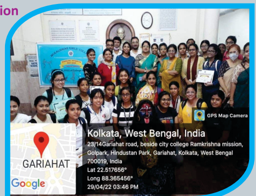
Indoor Sports Competition