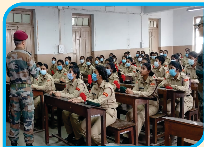
NCC Students & C.O.