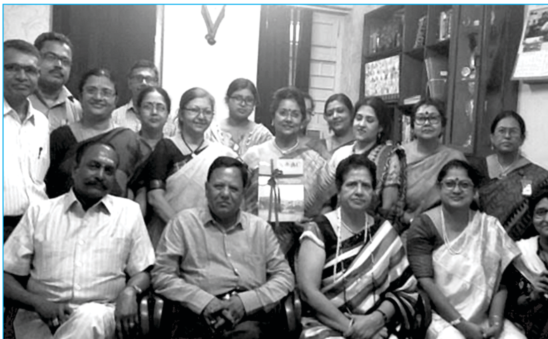
NAAC PEER TEAM MEMBERS WITH GOVERNING BODY MEMBERS