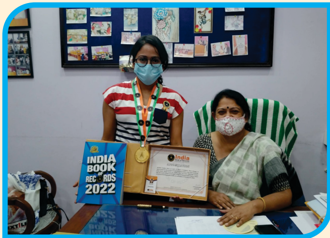
Student after Winning Prizes with Principal