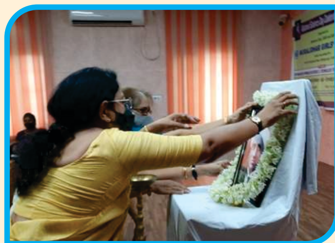
"National Science Day"