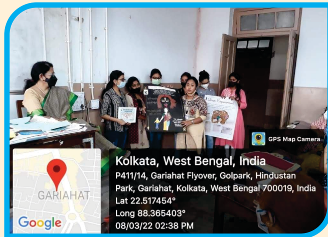
Poster making competition for Women's Day