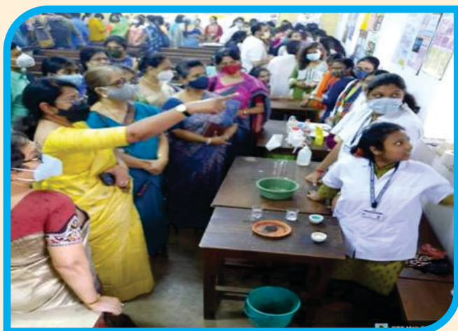
"National Science Day"