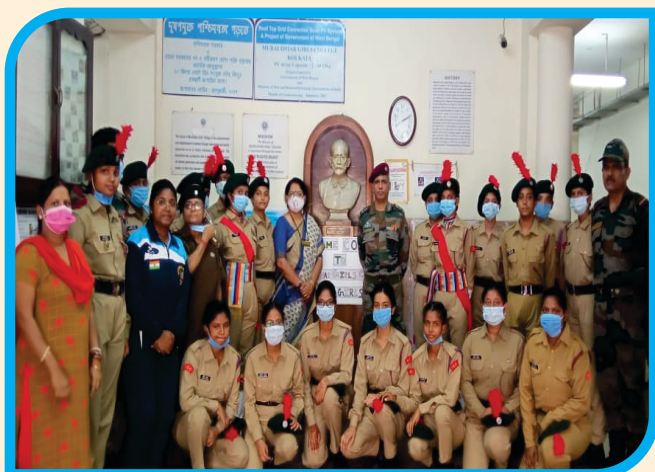
NCC Students with Principal & C.O.