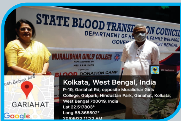
President & Principal in a Blood Donation Camp at College Campus