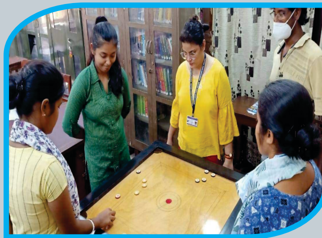
Indoor Sports Competition