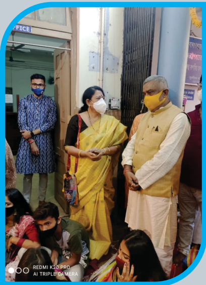
President & Principal in Saraswati Puja