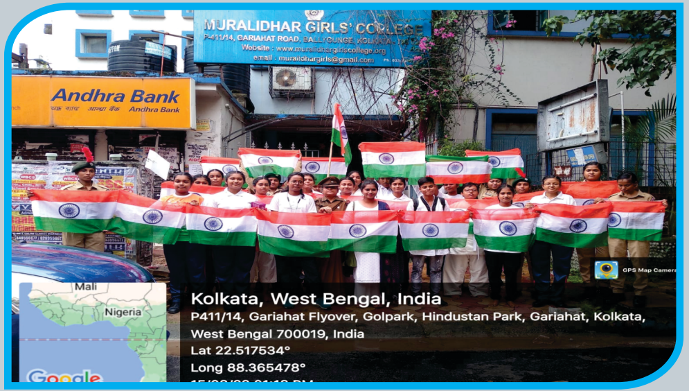
15th August Celebration